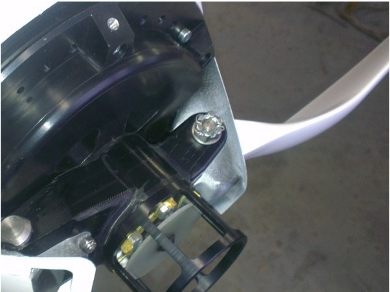
Fig.1 Propeller blades mounting on the holder

4.6 Tighten the spinner p.4 with special M4 Inox bolts p.3.